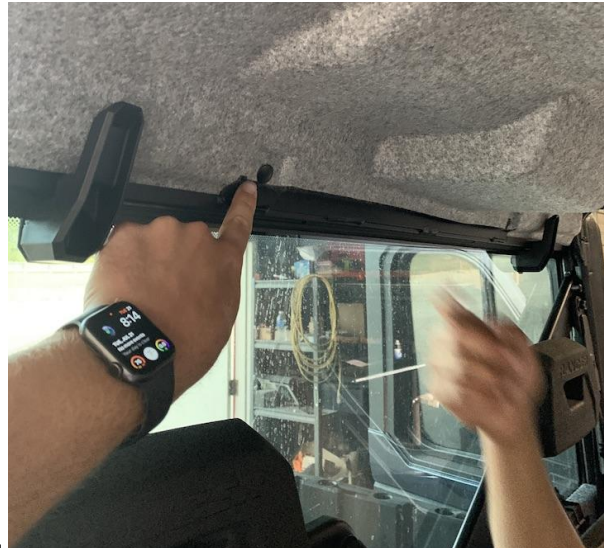
Polaris rear glass window.